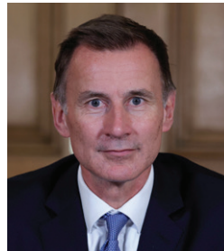
Official portrait of Jeremy Hunt MP

Some of the rumours, such as IHT reform, did not come to fruition, but there is still a chance – the Spring Budget is now less than four months away.